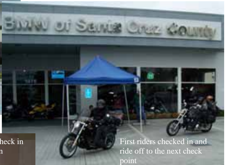
First riders checked in and ride off to the next check point