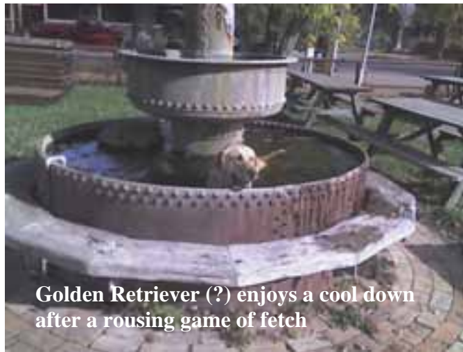
Golden Retriever (?) enjoys a cool down after a rousing game of fetch

retrieving a well-chewed tennis ball. To cool himself off, and perhaps for our entertainment, he would occasionally jump into the water fountain and rest awhile. It's a gesture many of us have probably considered the times we've visited Parkfield in the hotter months, but this day I was quite comfortable remaining dry, thank you.