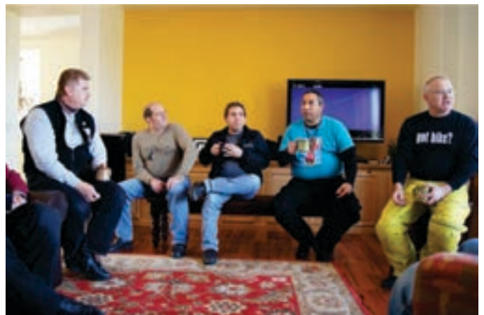
Bikers' coffee klatsch.