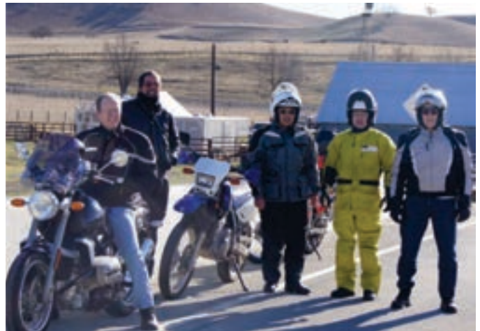
Rest stop on the bridge near Lonoak Rd and Hwy. 25

Seven of us met at Flapjack's in Tres Pinos for a ride to Parkfield. When I arrived, Gaylen and Jesús were already digging into full breakfasts. Others arrived at irregular intervals; no one seemed sure whether we were supposed to meet for breakfast at nine or leave at nine. No matter, it was another day of perfect weather for riding down the back roads of San Benito and Monterey Counties to lunch at the Parkfield Café.